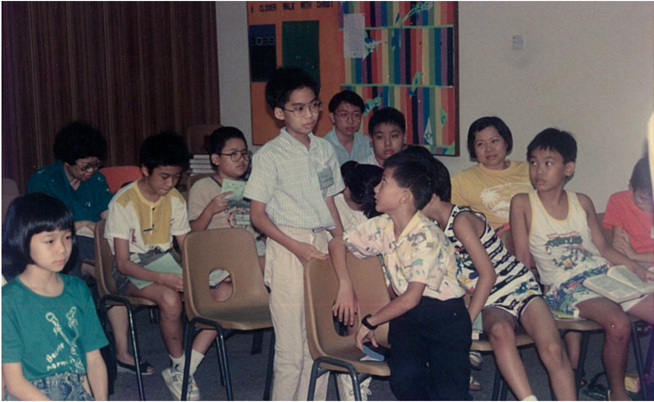
Calvary Missions to Children, 1990