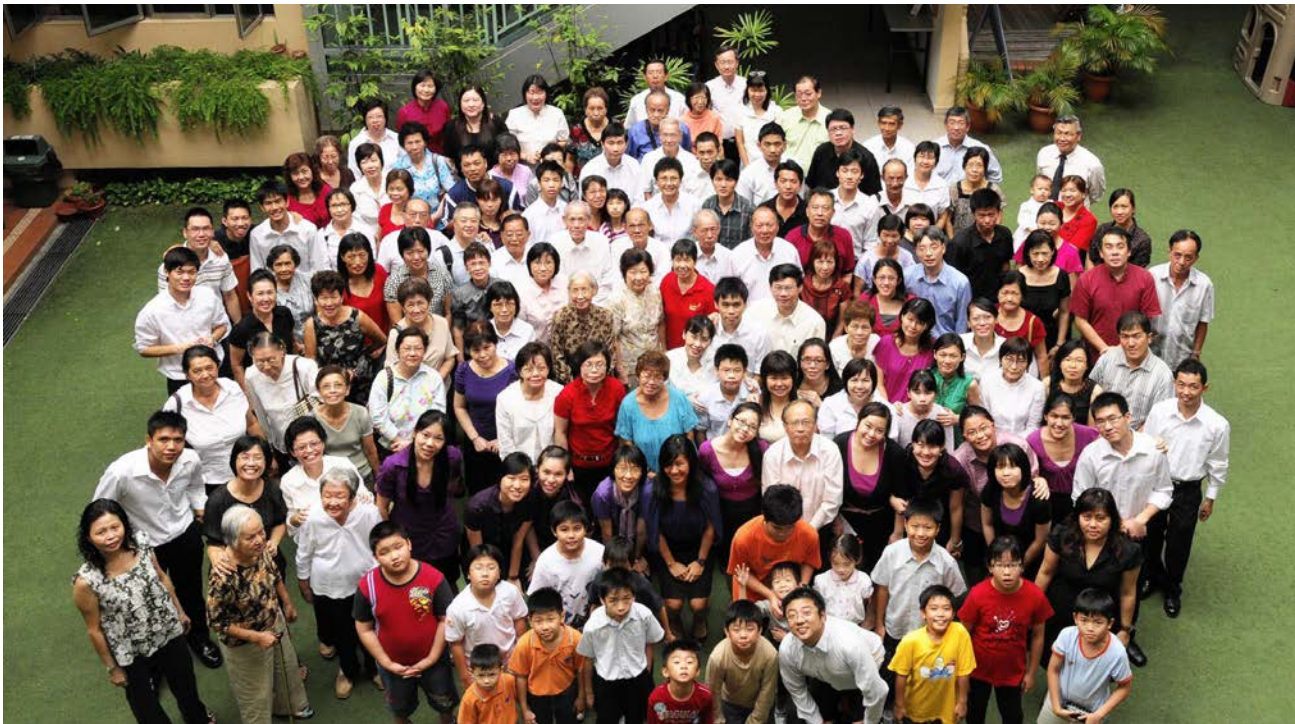
Mandarin Congregation, 2009

congregation. Clearly, their strategy was to effect the dissolution of the Mandarin Ministry by catching the Board of Elders unaware, and were confident that their strategy would succeed. Thankfully, by God's grace, we were preserved despite their machinations.