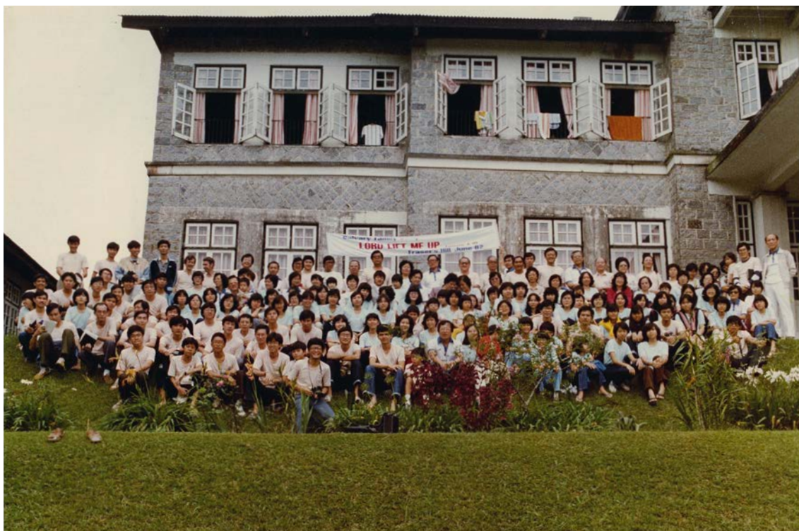
Church Camp at Fraser's Hill, 1982