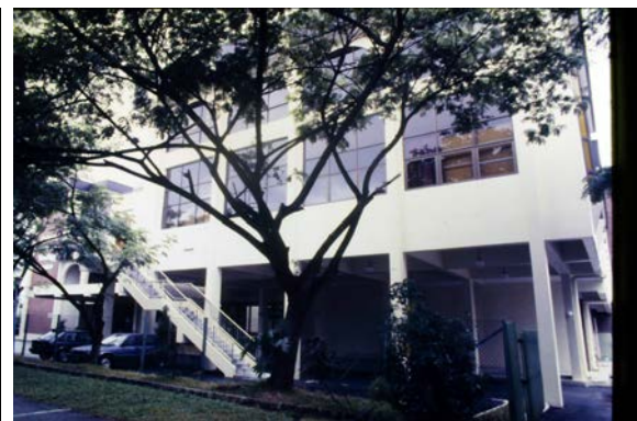
Church building, 1980-90s