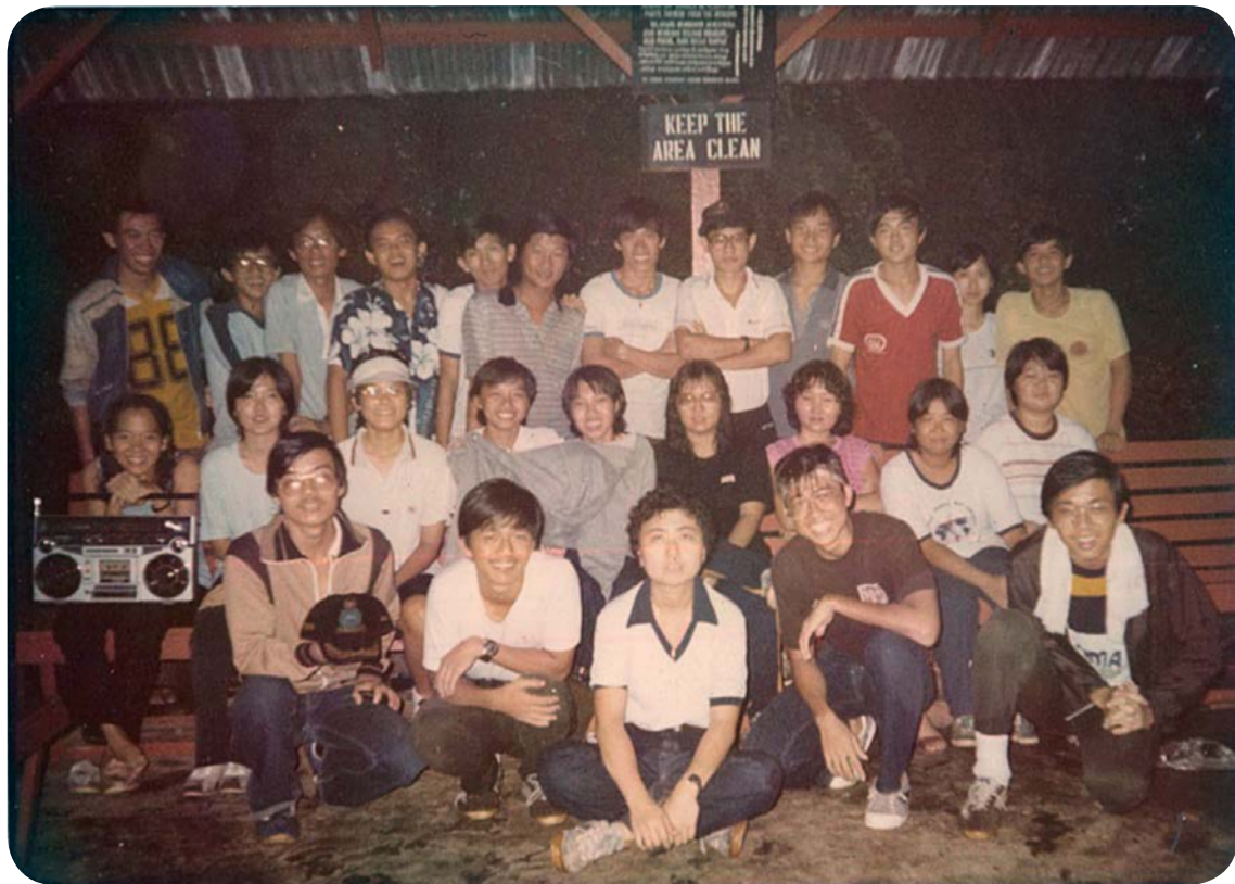
Youth Fellowship Camp, 1980s