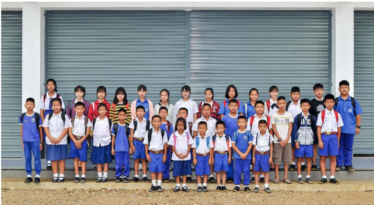
Bethel Hostel Ministry

The children hostel ministry aims to lead and bring the children to the Saviour and to nurture them to "... grow in grace, and in the knowledge of our Lord and Saviour Jesus Christ. To him be glory both now and for ever. Amen" (2 Peter 3:18).