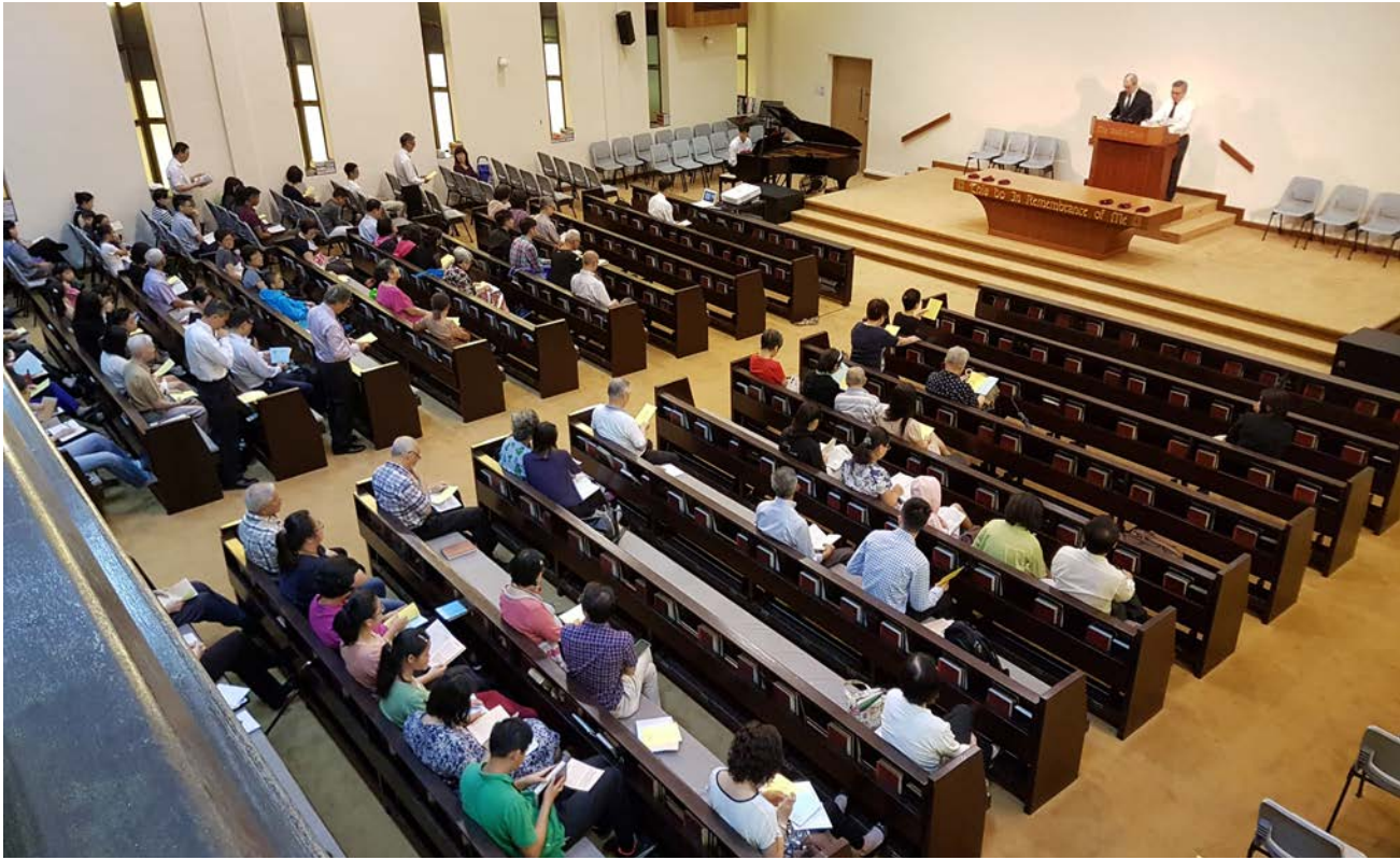
Mandarin Congregation, 2017