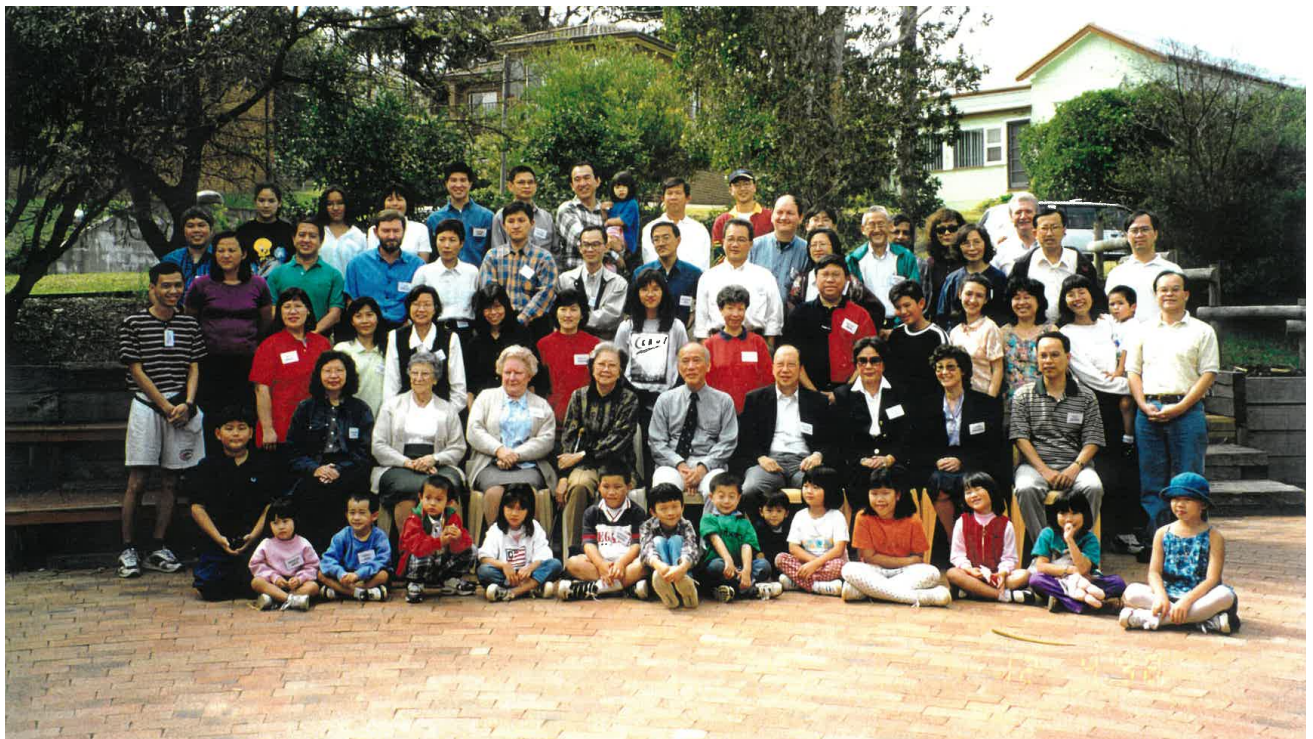
First Family Bible camp, 1998