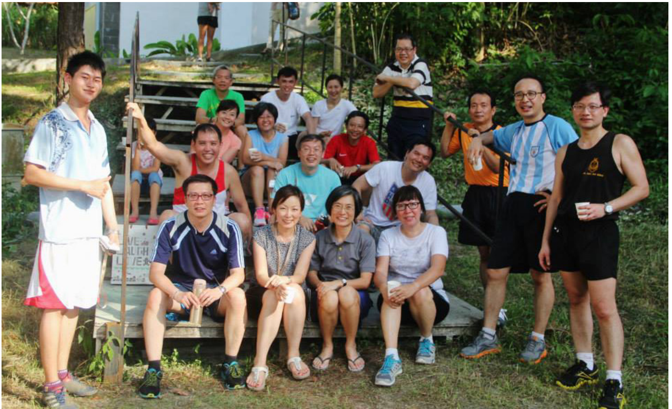
Church Camp at Putra Jaya, Marriott, 2014