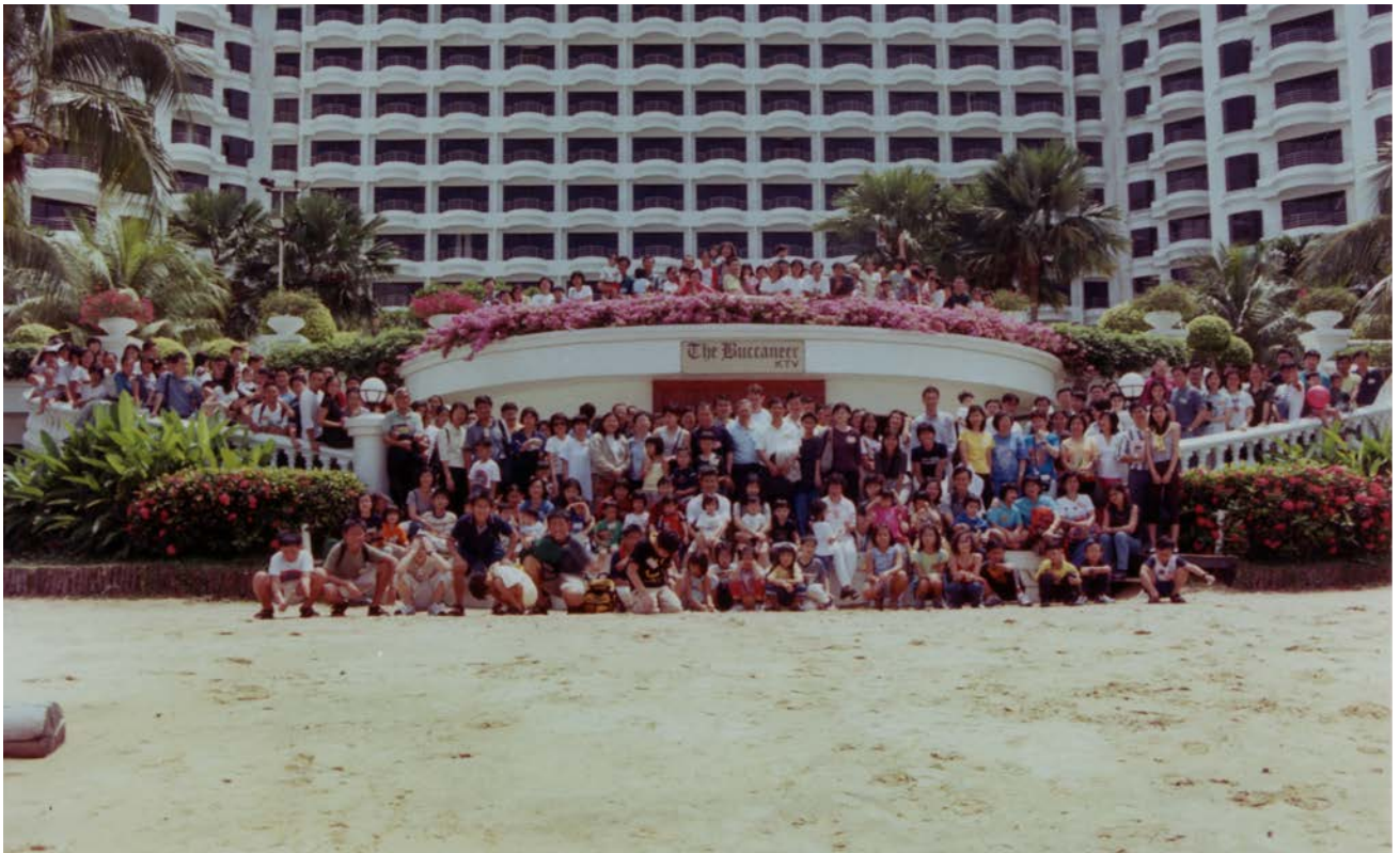
Church Camp at Malacca, Hotel Riviera, 2001