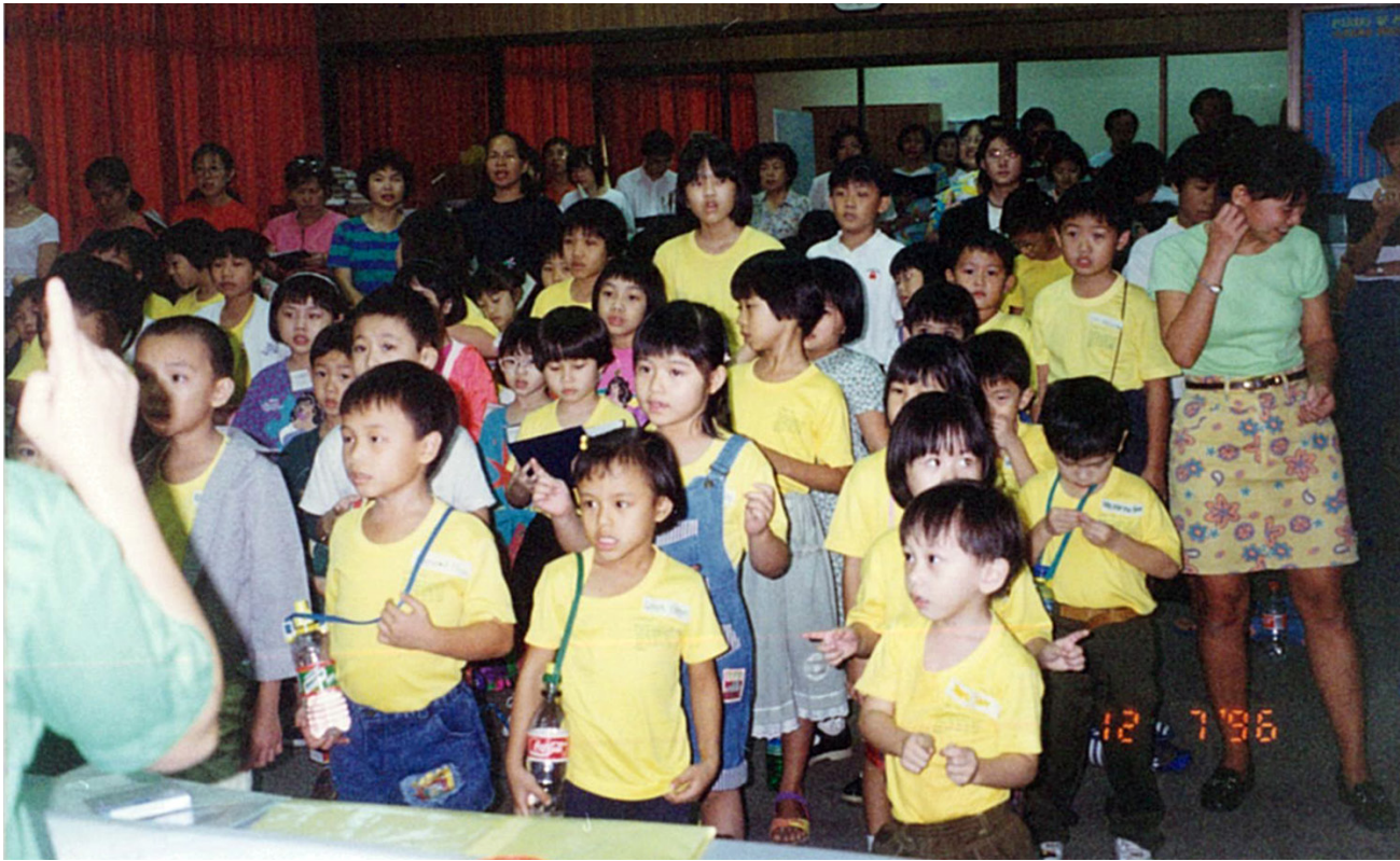
Calvary Missions to Children, 1996