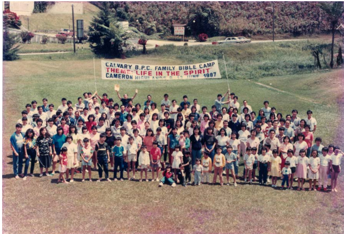
Church Camp at Cameron Highlands, 1987