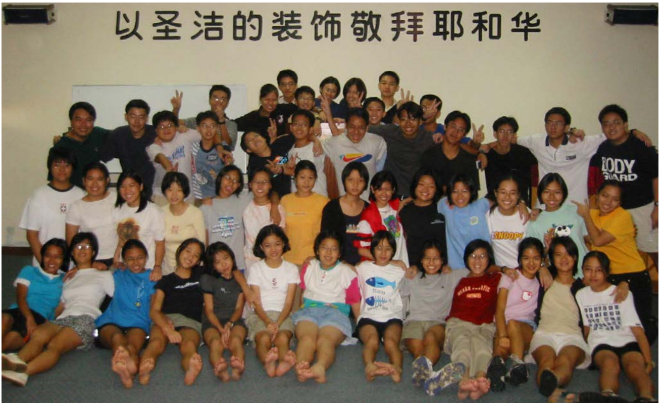
Teenz Camp, 2002