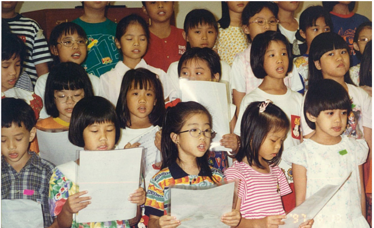
Junior Worship Christmas Presentation, 1997