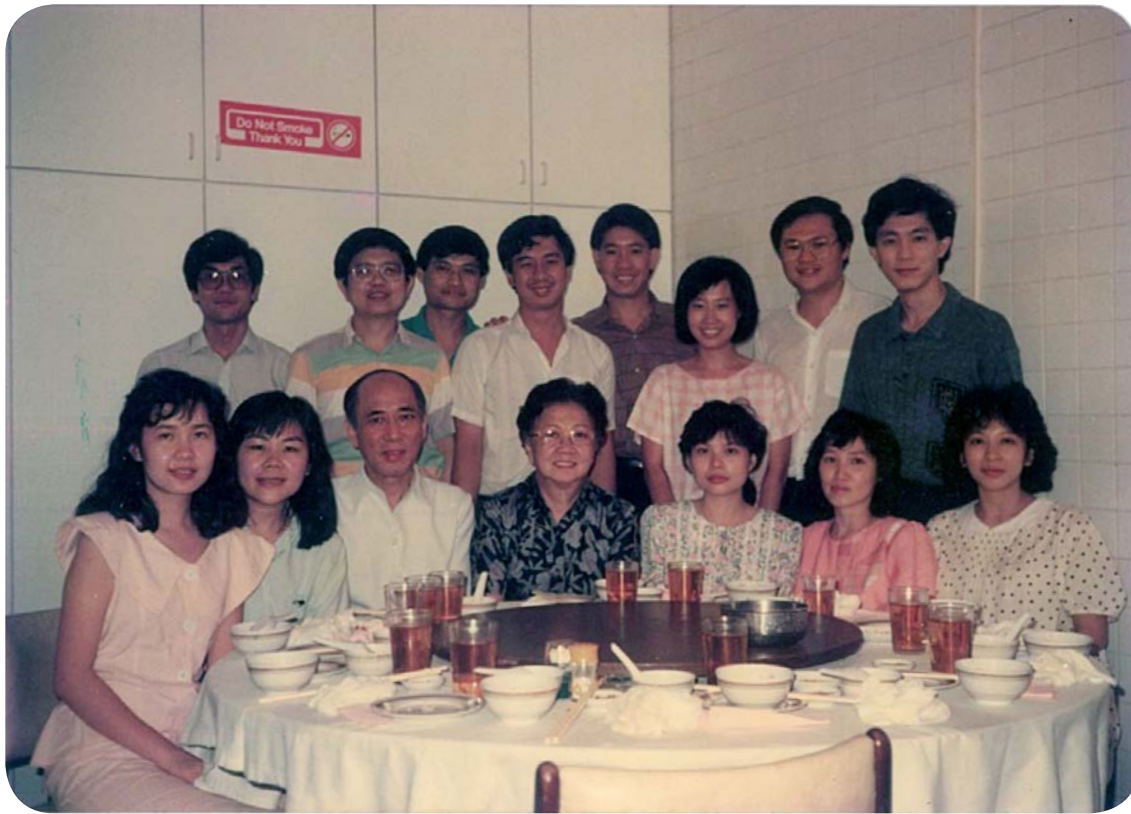
Bible Study Group, 1980s