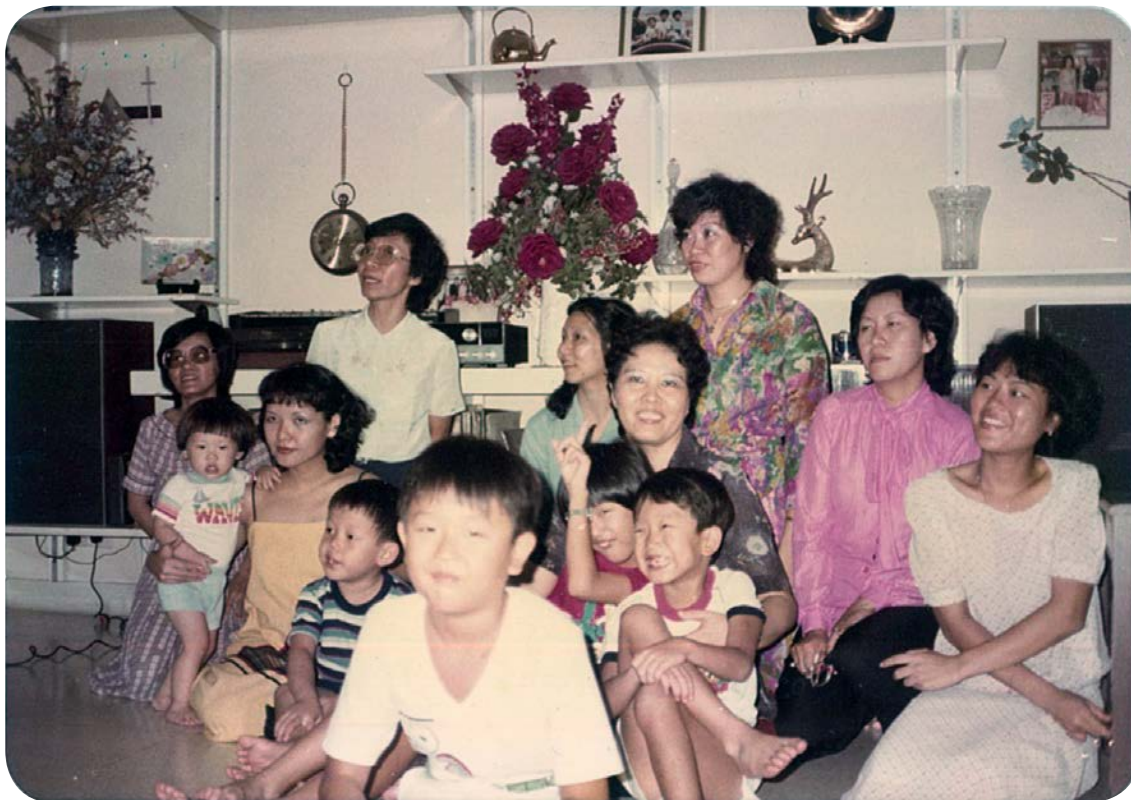
Ladies Fellowship, 1980s