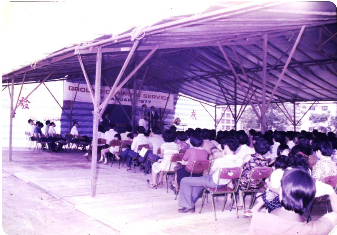
Ground Claiming Service, 1977