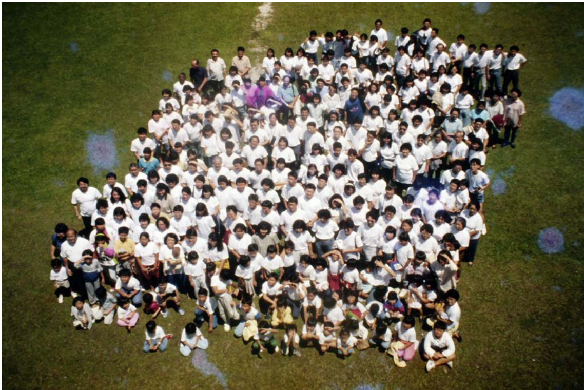
Church Camp at Port Dickson, 1986