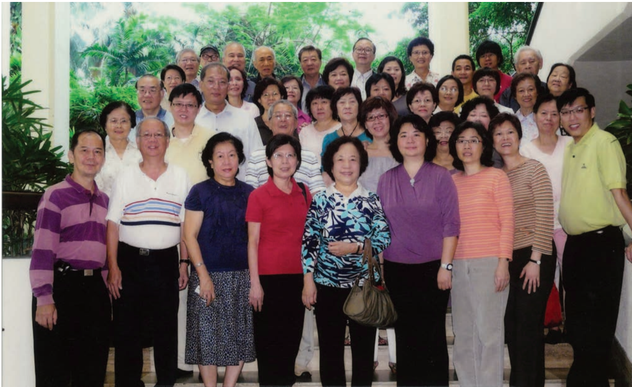
Golden Years Care Group at Penang, Hotel Equitorial, 2009