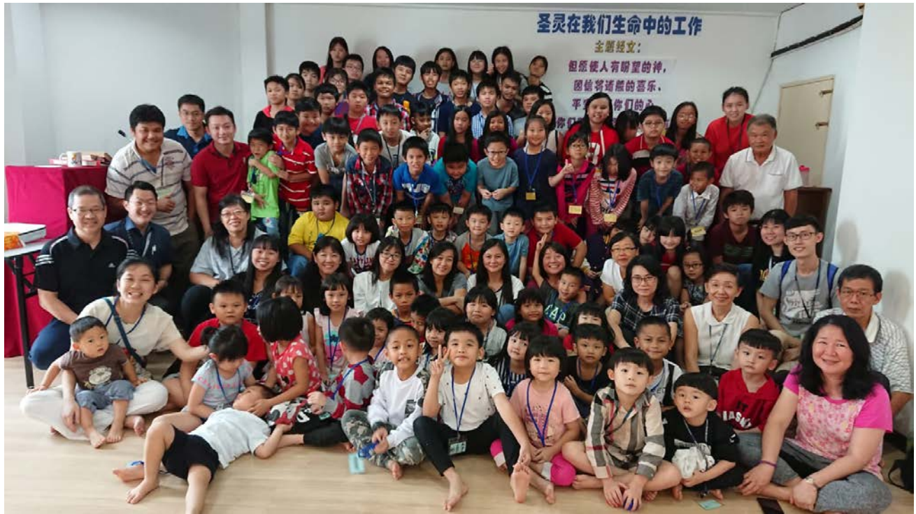
VBS at Sibu, 2019