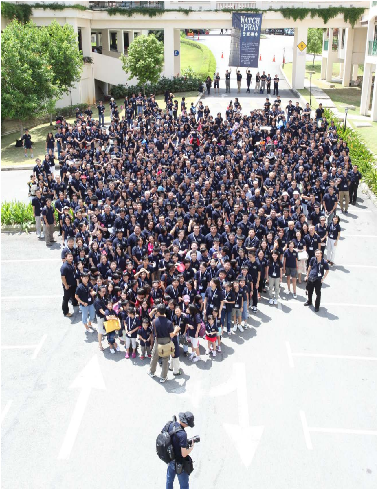
Church Camp at Gambang, 2012