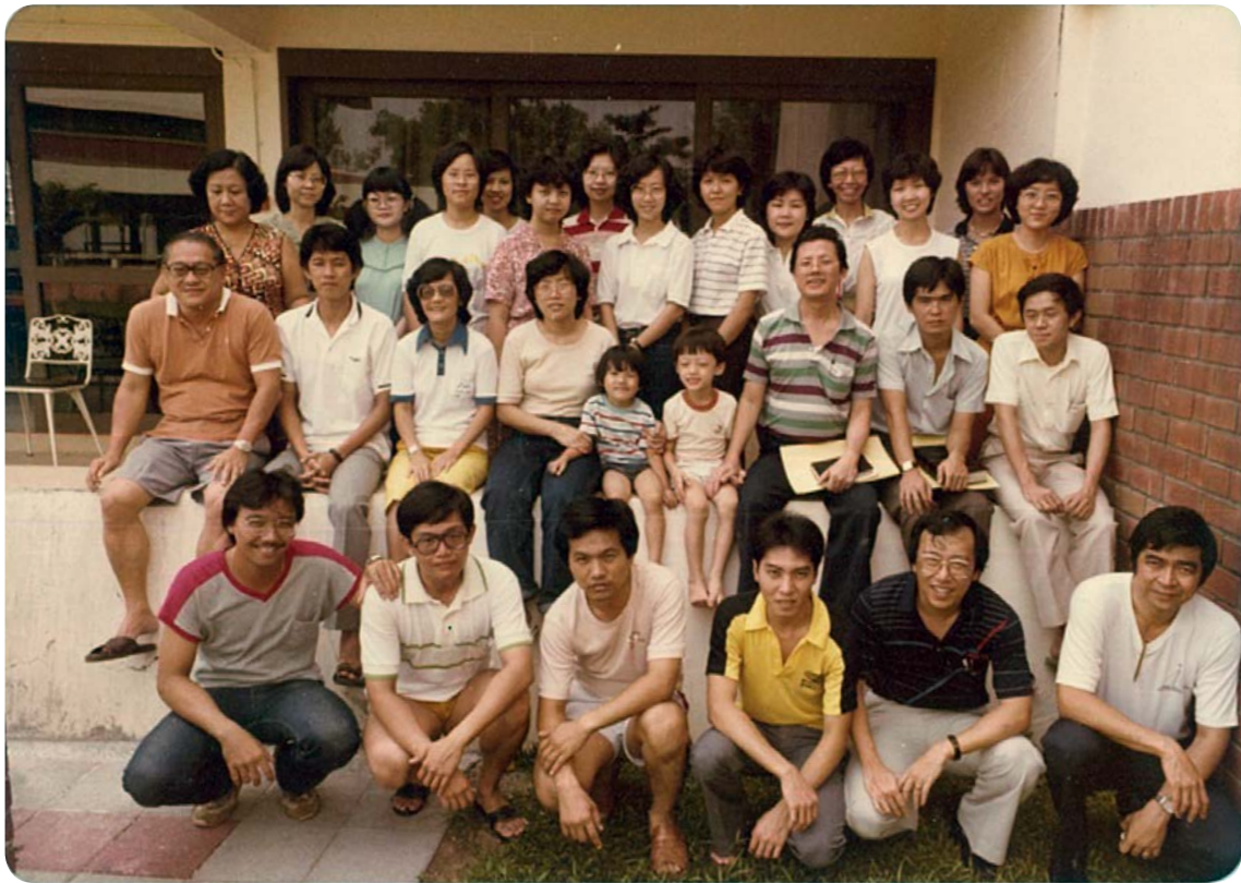
Adults Fellowship, 1982