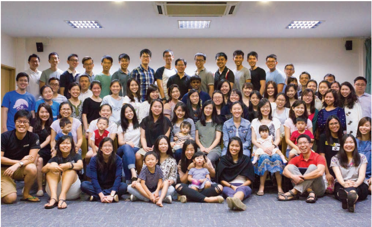
Combined True Life - Pandan Young Adults Fellowship Meeting, 2016