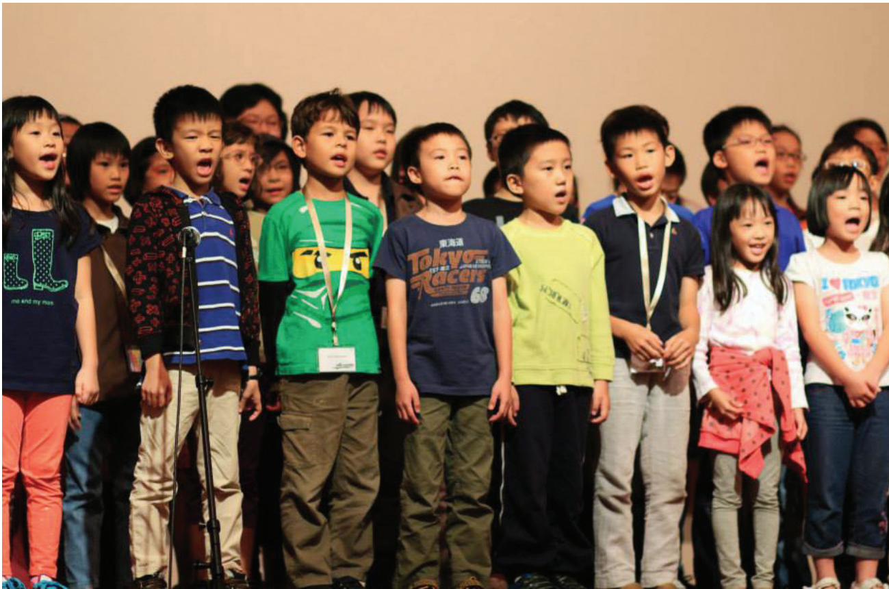
Church Camp at Putra Jaya, Marriott, 2014