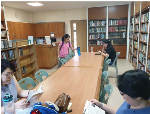
The Book Library, 2019