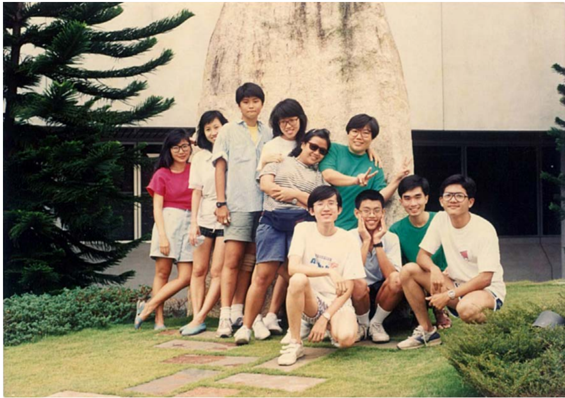
Young Adults Fellowship Outing, 1980s