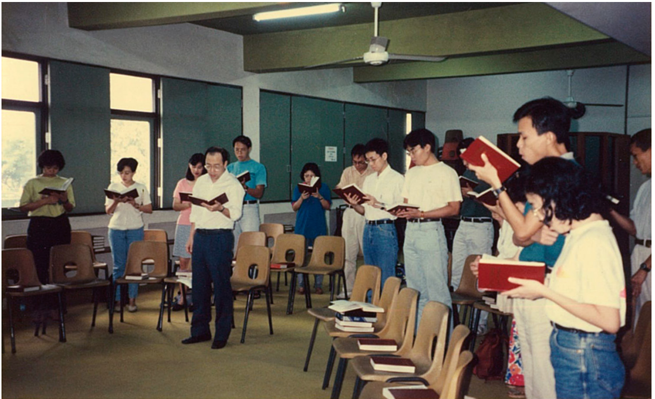
Young Adults Fellowship Retreat, 1994