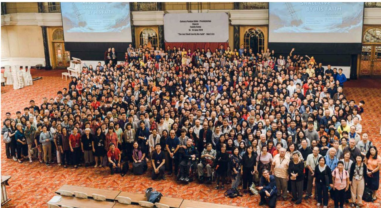
Church Camp at Kuala Lumpur, Renaissance, 2019