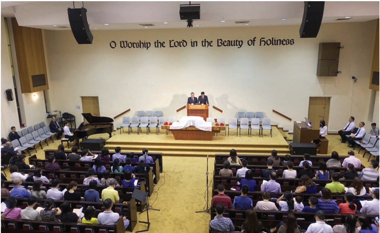
Year End Service, 2015