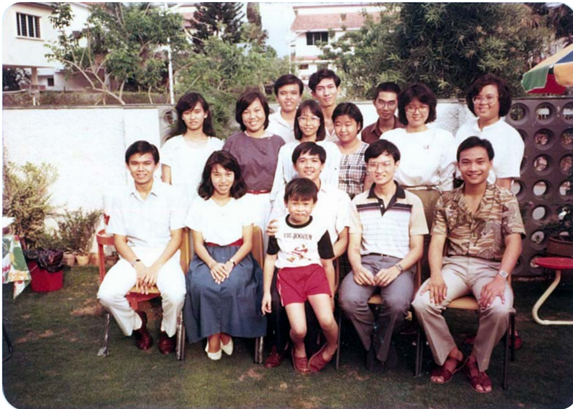
Youth Fellowship Chinese New Year Visitation, 1985