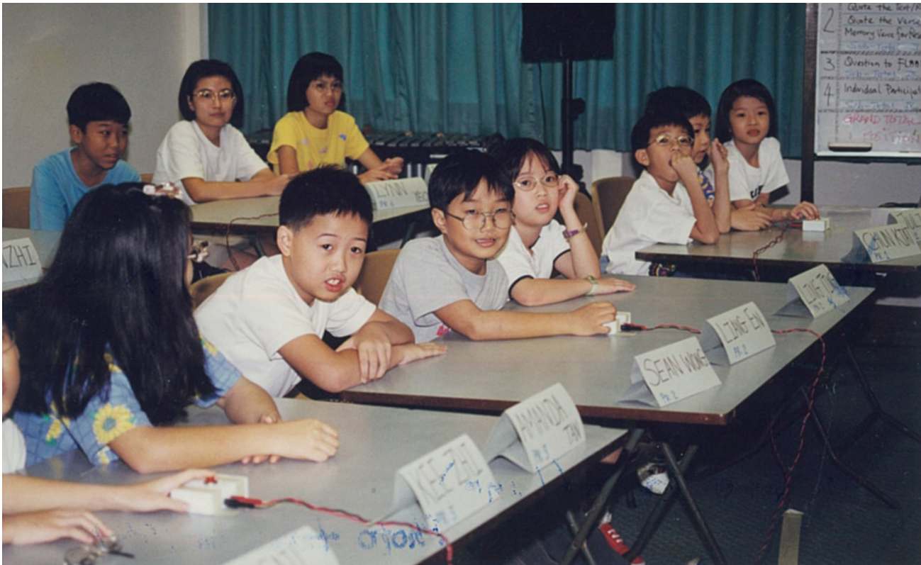
Sunday School Primary 6 Bible Quiz, 1996