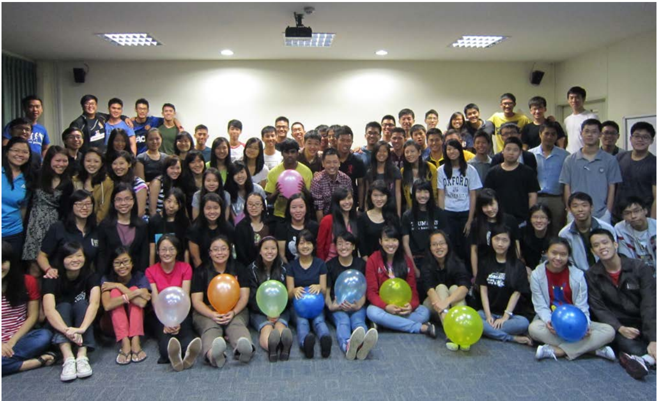
Combined FCM Meeting, 2013