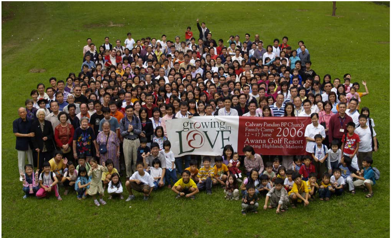
Church Camp at Genting, Awana, 2006