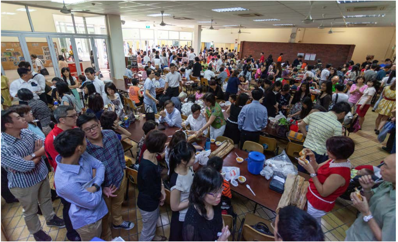
Bring Your Own Bread, 2013