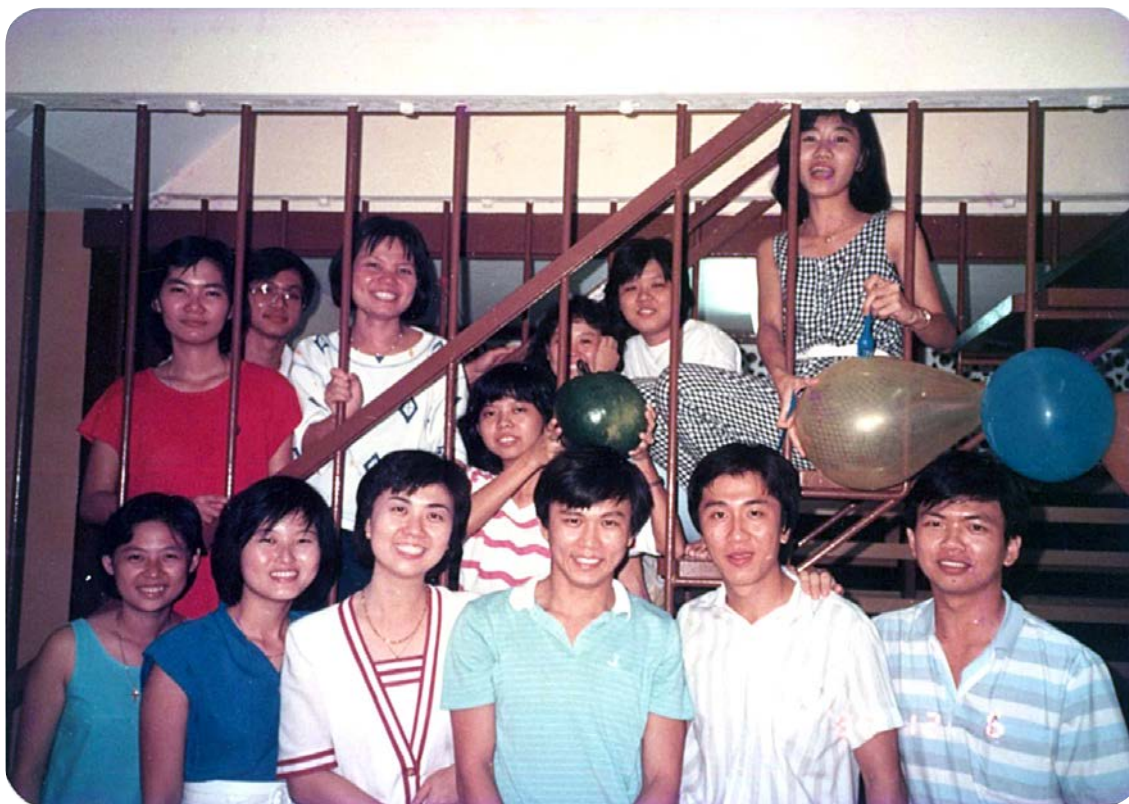
Young Adults Fellowship Camp at Pasir Ris Chalet, 1986