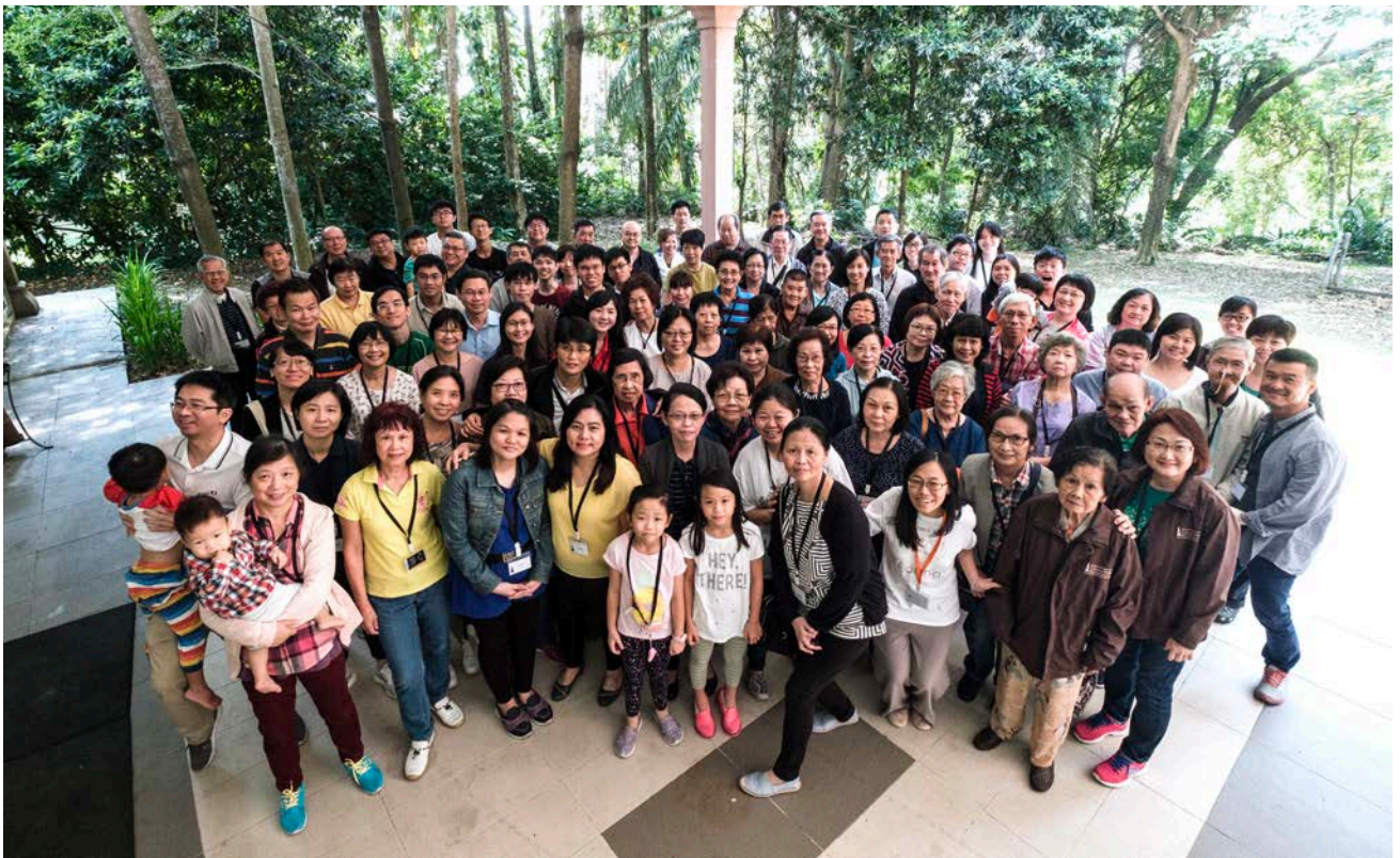
Church Camp at Putra Jaya, Marriott, 2018