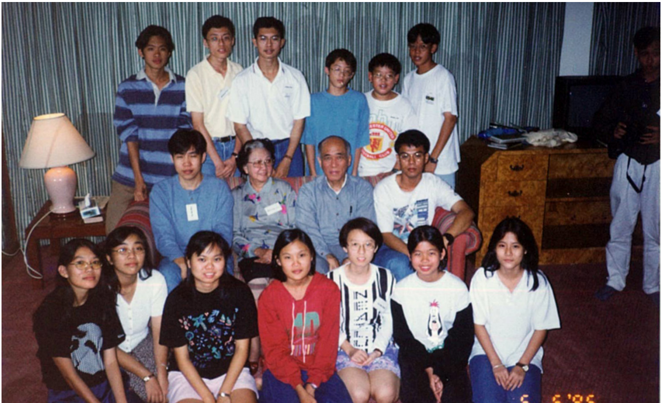
Youth Fellowship, 1995