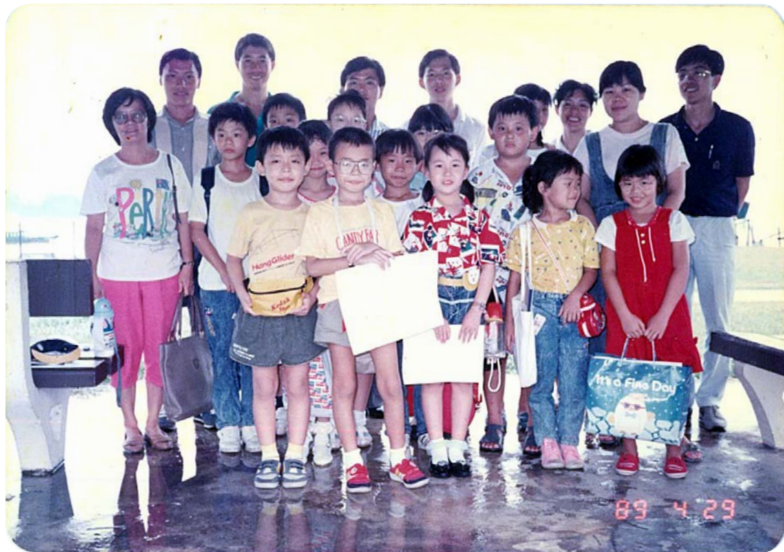
Calvary Missions to Children, 1989