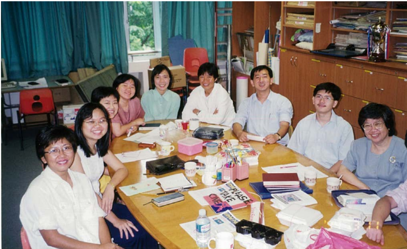
Junior Worship Teachers' Meeting, 1994