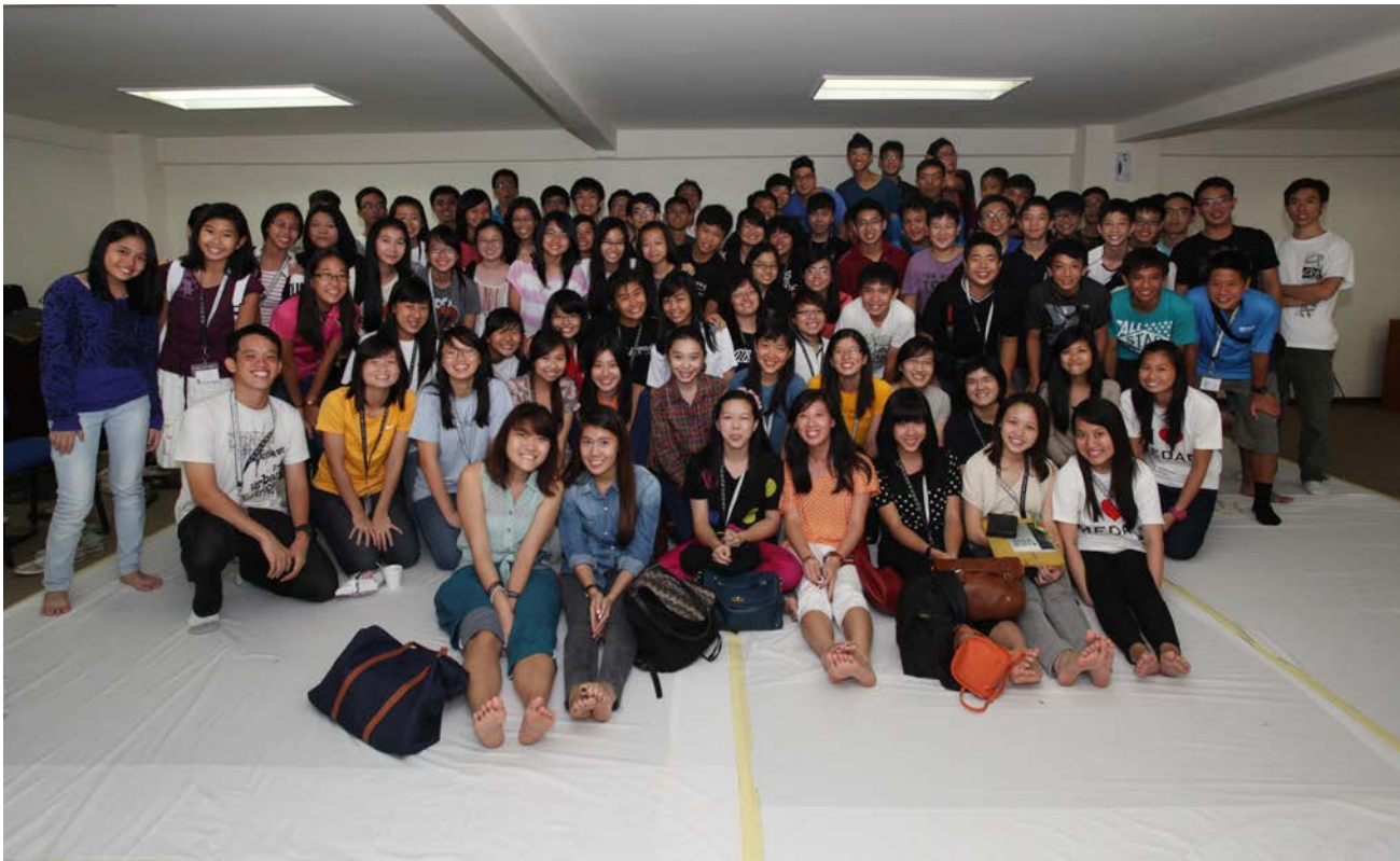
Youth Fellowship at Church Camp, Gambang, 2012