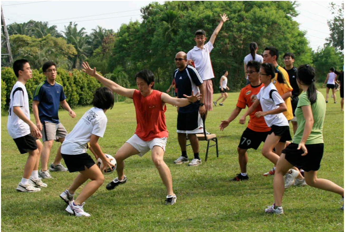
Church Camp at Kuala Lumpur, Glenmarie, 2011