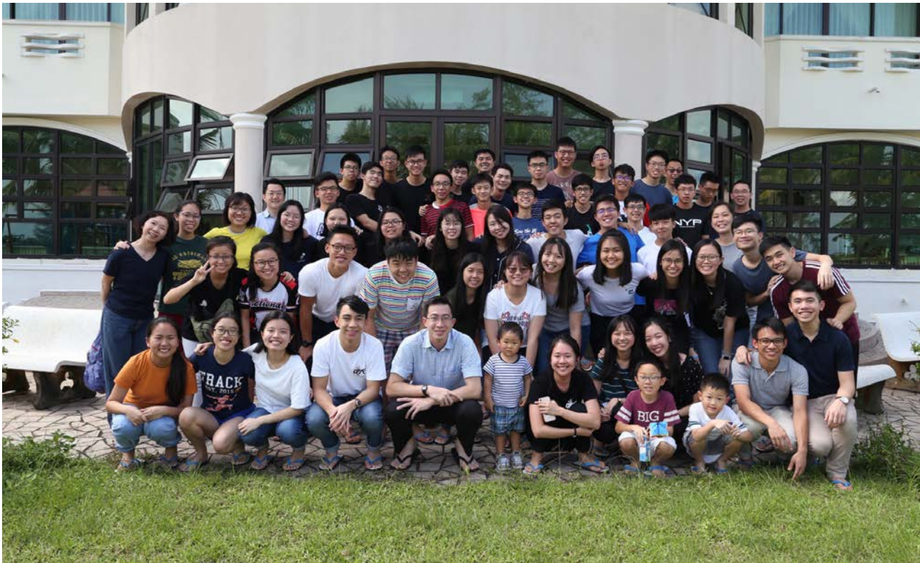
Youth Fellowship Camp at Mersing, 2018