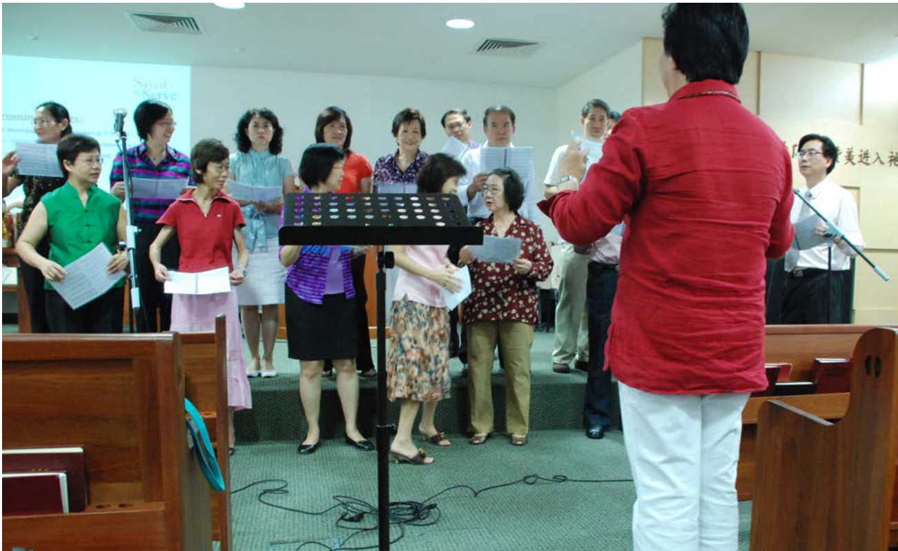
Adults Fellowship, 2008