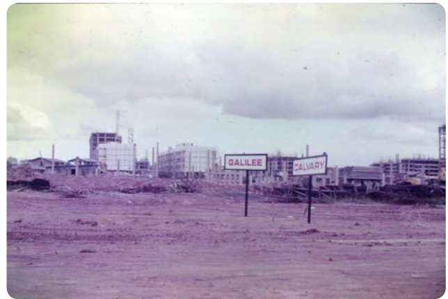
Ground Claiming Service, 1977