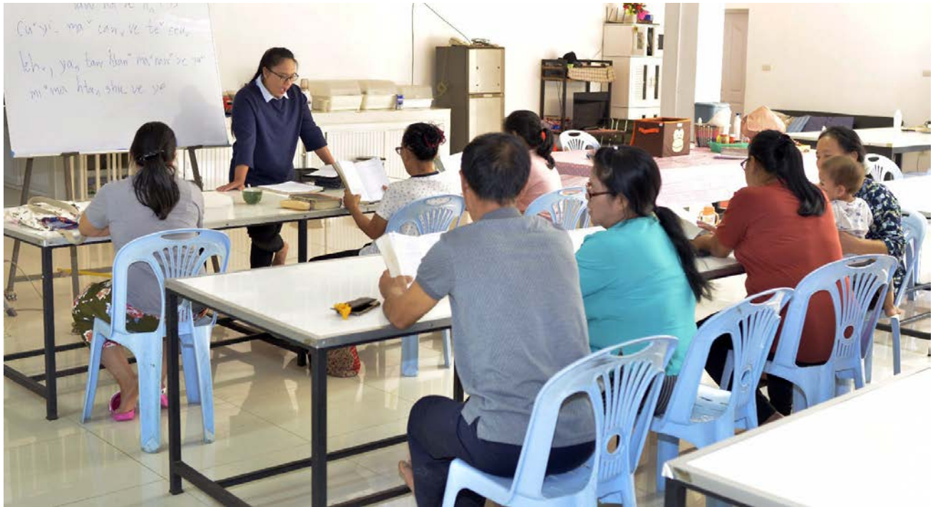
Bethel Bible College

The children staying at the hostel range from Primary 1 to University level.