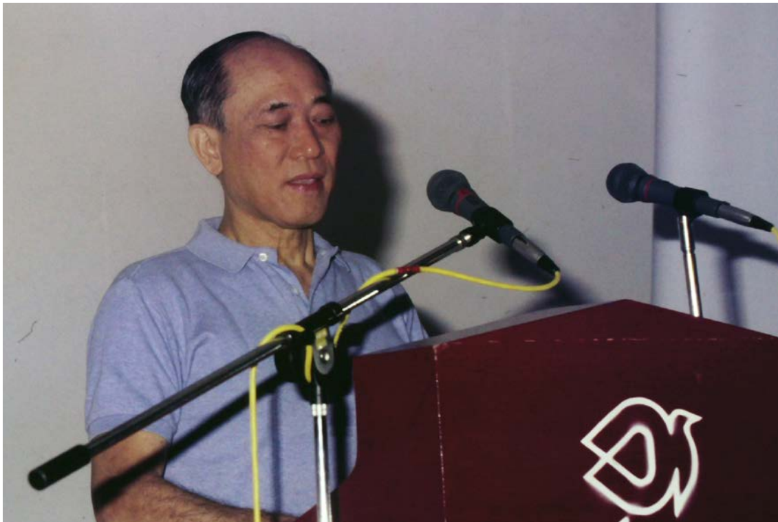
Church Camp at Genting, Awana, 1988