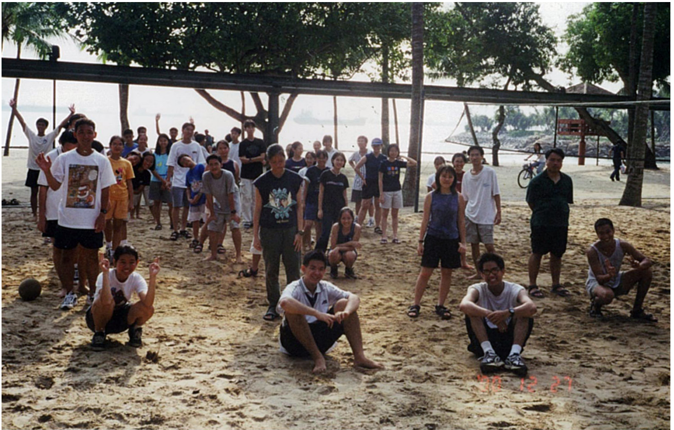
Youth Fellowship Outing, 2000