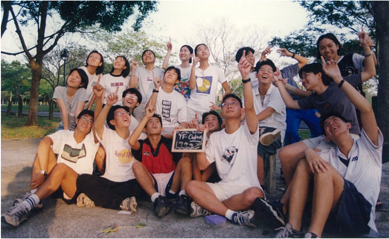
Youth Fellowship Outing, 1999