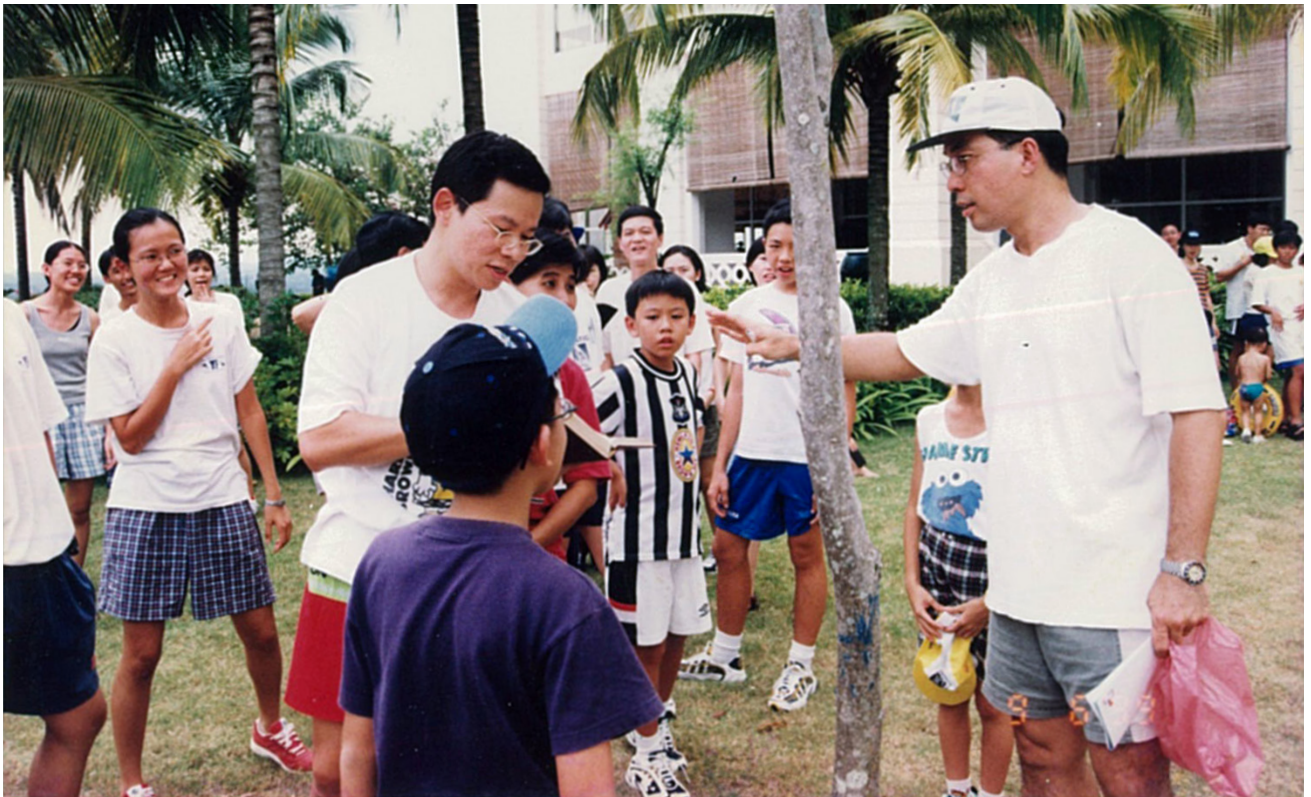
Church Camp at Hotel Equatorial Bangi, Putrajaya, 1999