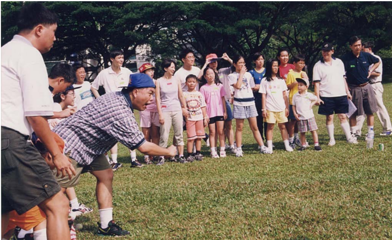
Family Day, 2000