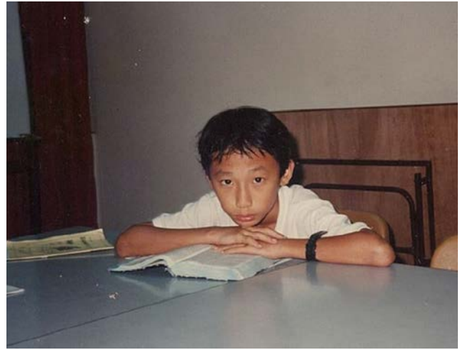
Taken during a bible study in my early teens.

In Secondary 3, I started attending YF. What a