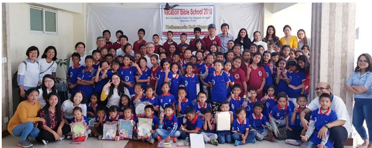
VBS at Kathmandu, 2018