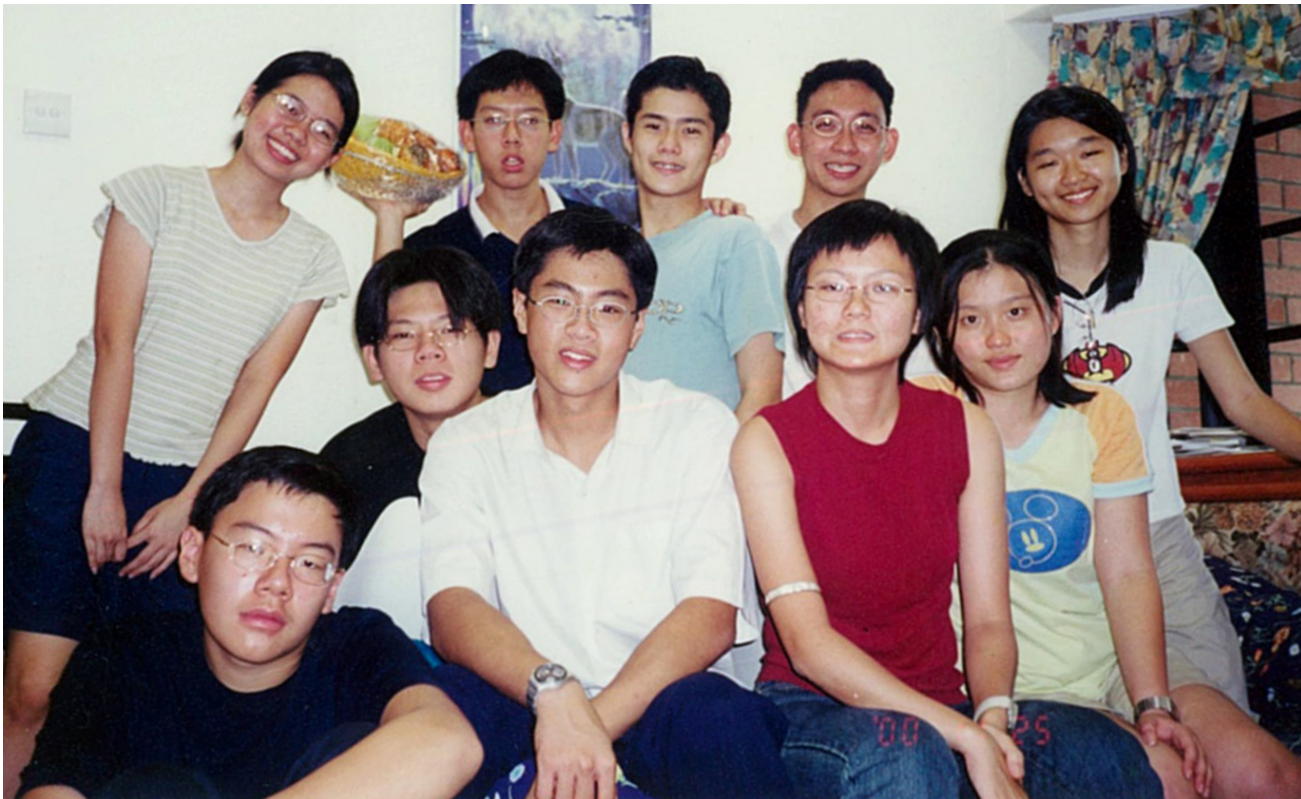
Youth Fellowship, 2000