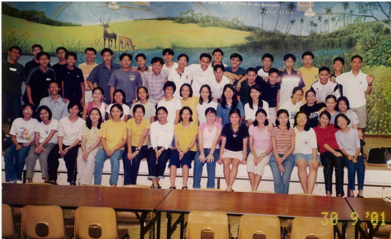
Combined Jurong - Pandan Youth Fellowship, 2001