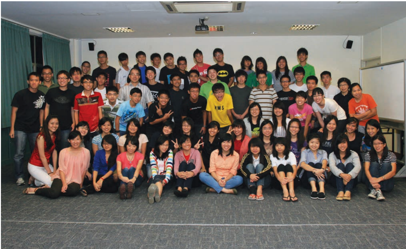
Combined Youth Conference, 2011