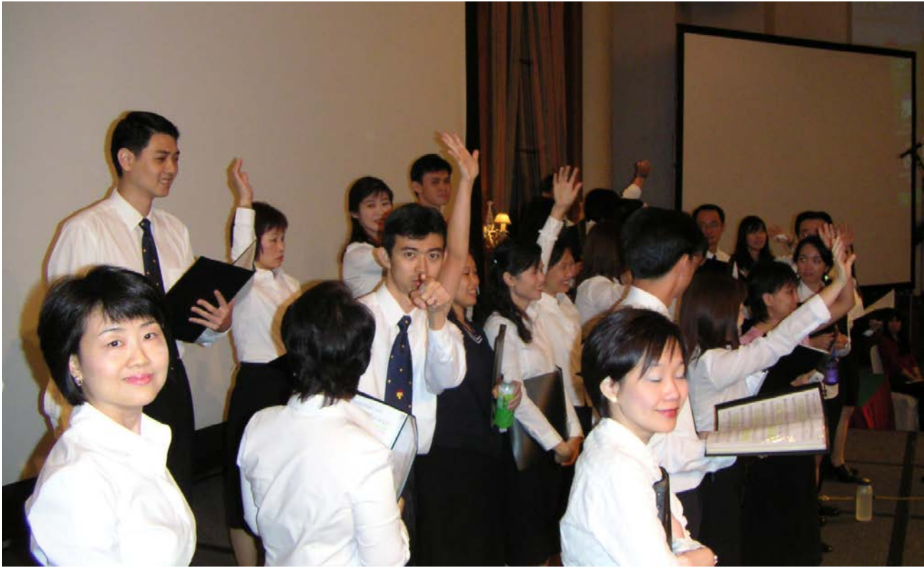
Choir presenting at Church 25 th Anniversary, Orchard Hotel, 2004