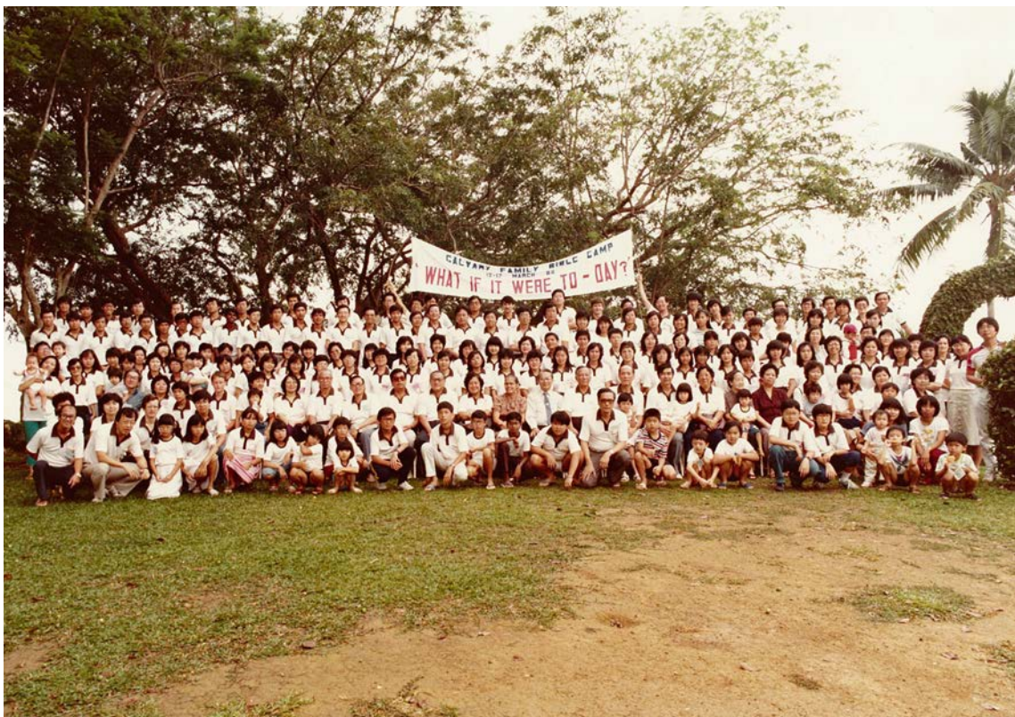
Church Camp at Port Dickson, 1984