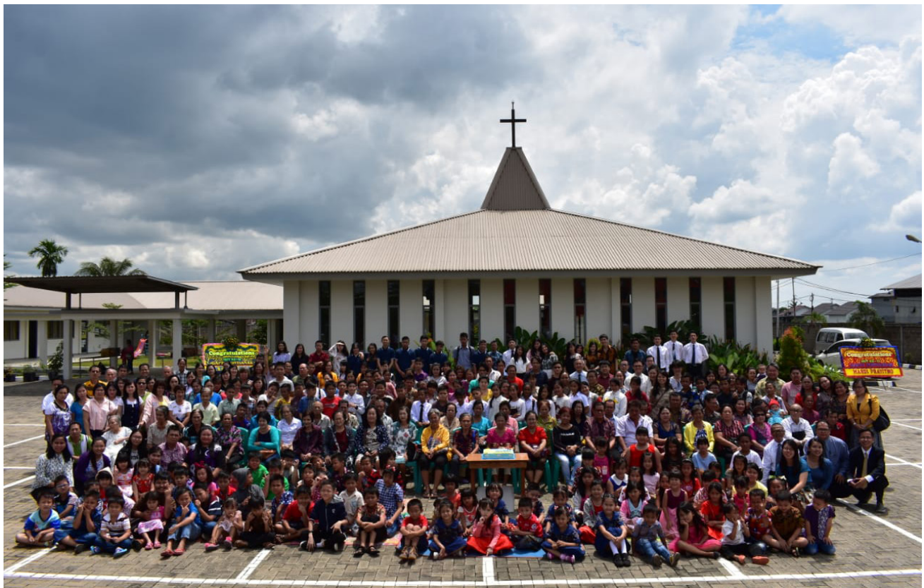
13 rd anniversary last week of October, 2018

Before Christ our LORD ascended to heaven, He commanded his disciples to be witnesses from Jerusalem unto the uttermost part of the earth (Acts 1:8). Based on this doctrine we expect the same for the church to branch out to as many places as the LORD leads. Thank God that the first SGBF was held on 4th December 2005. It went on for a few years but during a period of time was discontinued due to insufficient manpower. Although the SGBF had stopped, the Sunday school, which was held concurrently with the SGBF, was still being held because of the handful children that came to Sunday School faithfully. Thank God that the SGBF was