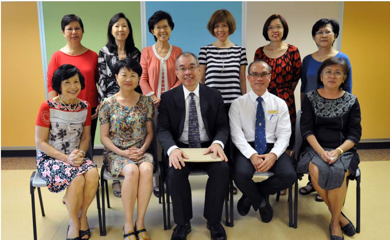
Ladies Fellowship, 2014