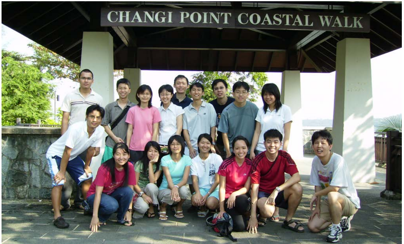
Young Adults Fellowship Retreat, 2007