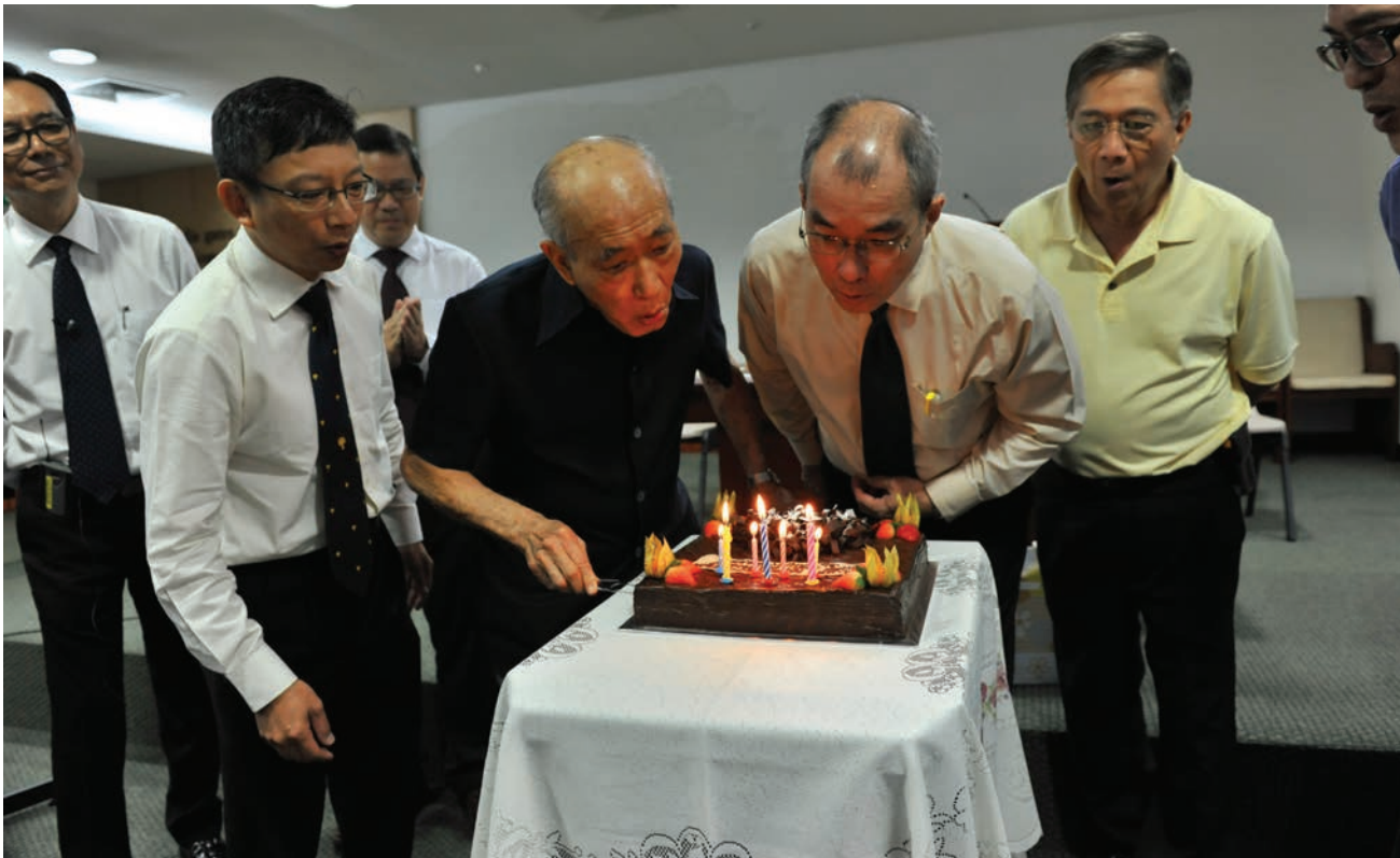
Senior Adults Fellowship, 2014