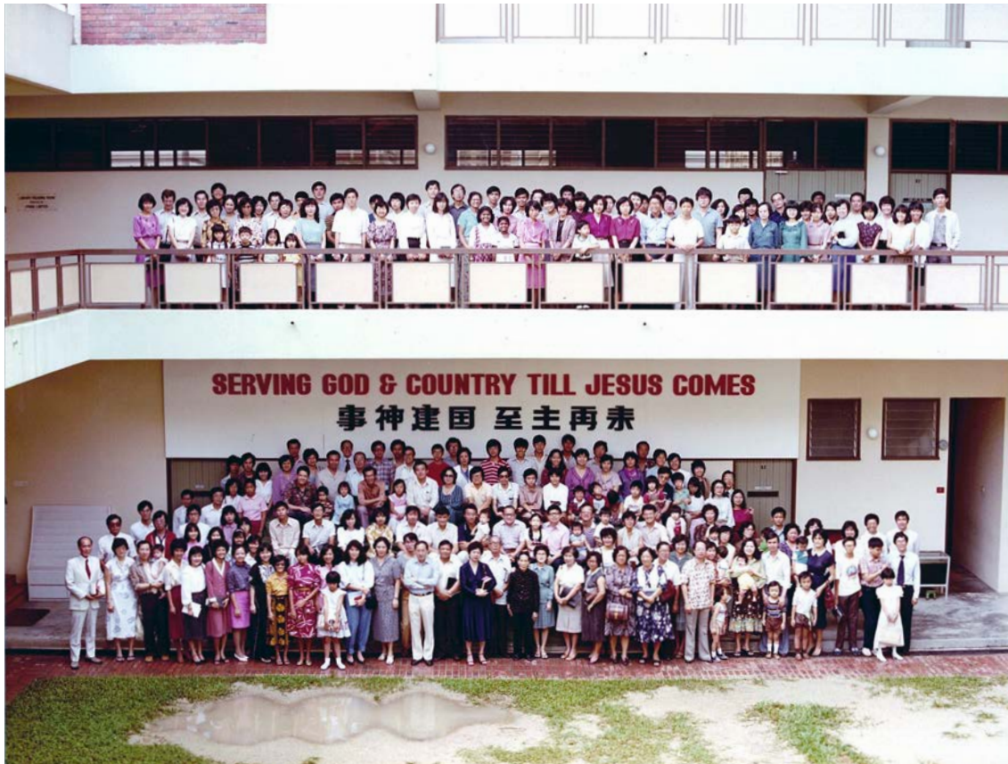
Calvary Pandan B-P Church 3 rd Anniversary, 1982