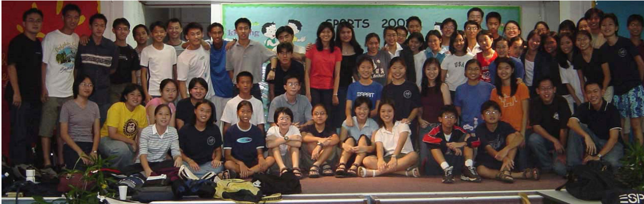
Combined Jurong-Pandan Youth Fellowship, 2002

The spiritual battle is hotter now 38 years on than it was before. Churches are falling away, and so are youth fellowships within these churches. Worldly philosophies have infiltrated churches and demand that youths be made to feel comfortable and that churches ought to meet their needs and adolescent awkwardness at all cost. It is important that the focus of CPYF be not diverted because of such distractions. The church and parents have to dictate what is good for their teenage children, and should not leave them to their own devices and ‘comfort zone’ to their own spiritual detriment.